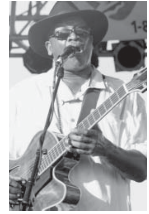
Taj Mahal is on the cruise <u>every</u> year.

I figured the best way to do it was to go through the week-long schedule on the first day and map out a game plan.