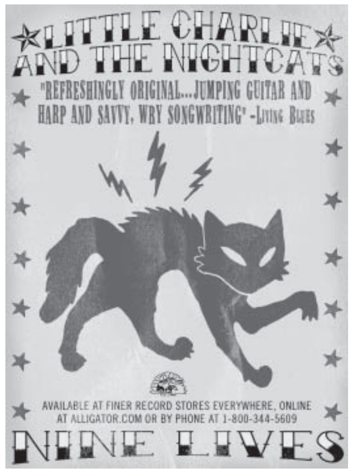
May/June 2005 · Issue 274

Specter is a bit jazzier a player than Freund, but both are authoritative modern Chicago blues guitar stylists who have built up solid catalogs. Delmark has issued their joint new recording, Is What It Is , that gives both a chance to display their considerable skills on a selection of blues and some interesting covers of