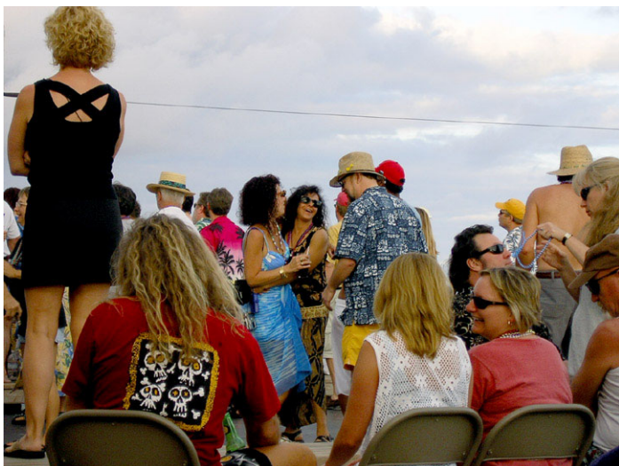
Crowd shot by the Pool Stage.

As far as cash money goes, you don't need