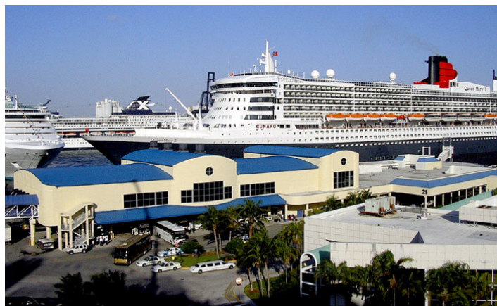
We ended exactly where we started out - docked in Fort Lauderdale next to the the gigantic Queen Mary 2.

The 2006 Legendary Rhythm & Blues Cruise is now booking for January 8-15 on Holland America's Ms. Westerdam. From what I can tell, it