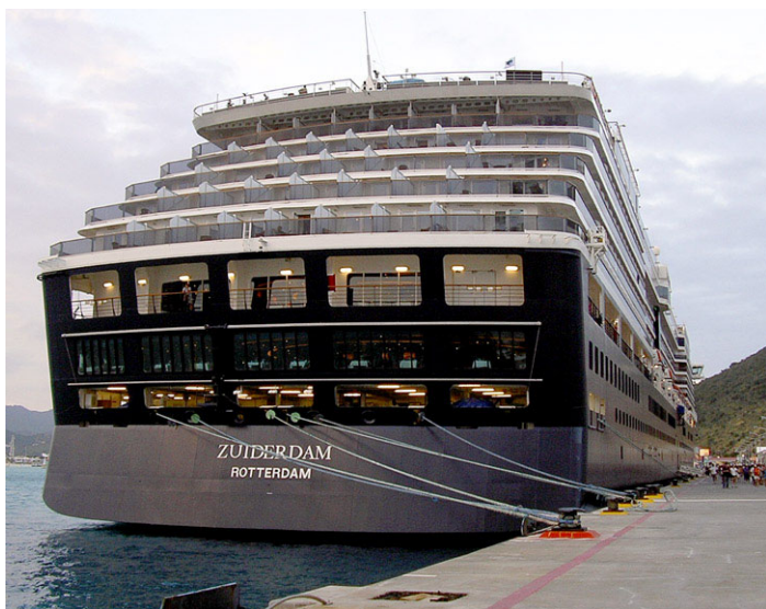
The stern of the Holland America m/s Zuiderdam docked in Tortola. The windows you can see in the two lower decks (in the black section) are the main dining room.

After another long day of nonstop music on Day 7, the party culminated with a blowout in the Vista Lounge featuring Derek Trucks at 11:30 p.m. followed by the Open Jam Finale from 1:15 until God knows when. I stayed as long as I could hold up and watched the rest on TV in my room until I passed out. Throughout the cruise one station had a live feed from the Vista and another had blues documentaries. About the only place I didn't notice anything about the blues was in the shower, but perhaps I simply missed it.