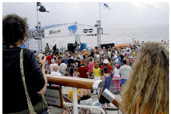
Deck 10 just above the pool deck was a good spot to see the bands on the Pool Stage.