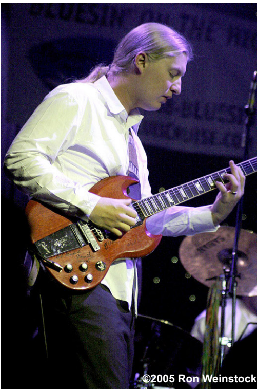
Derek Trucks.

at all. Dr. John mixes jazz and blues into his Creole voodoo swamp gumbo, and Derek Trucks, though he played some blues, was really more of a jazzy jam band. In fact, he even did a version of John Coltrane's take on "Greensleeves" that blew