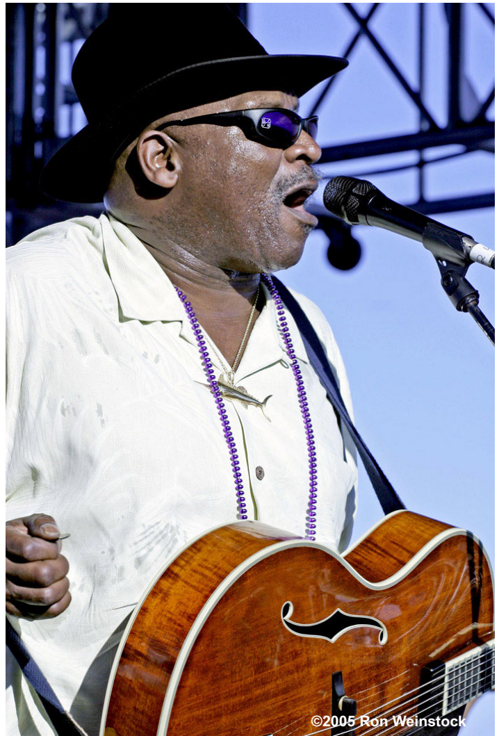
Taj Mahal performs every year on the Legendary Rhythm & Blues Cruise.

The alcoholic drinks were not free. Could you