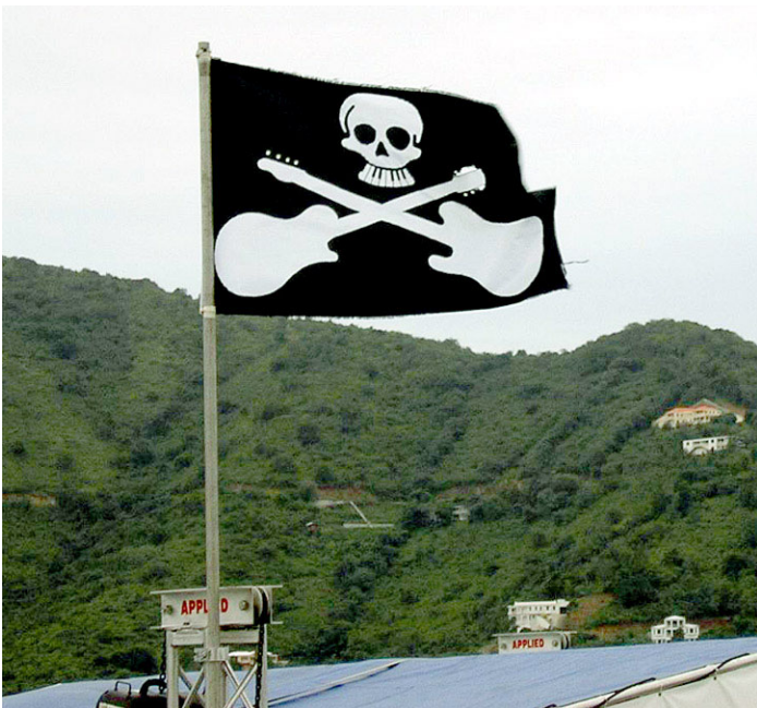
Our flag was flying high as we pulled into Tortola.

The ship had many amenities to enjoy. There was a spa where cruisers could enjoy (for a fee) exotic skin, body and hair treatments including hot stone massages. The spa's fitness facility included exercise equipment and exercise professionals for personal training. There was also a casino, a coffee bar, swimming pool and a duty-free gift shop where a wide variety of items could be purchased without paying tax or duty. The prices were extremely reasonable. But if you buy liquor, you can't take it to your room. You get it at the end of the