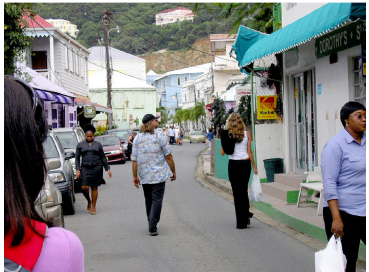
Street scene in Tortola.

On Day 4 we arrived around noon at Tortola in the British Virgin Islands. As I watched the cruisers