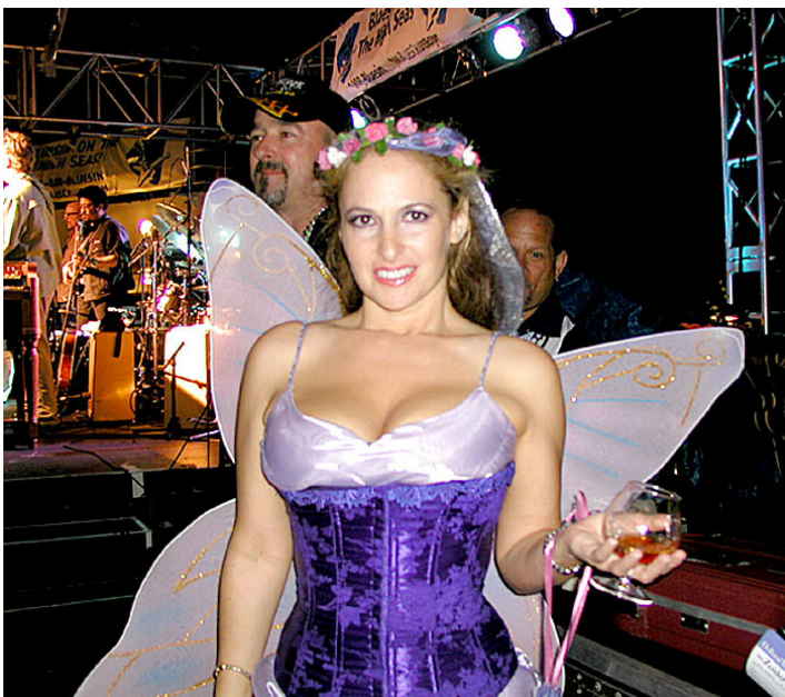
Definitely my vote for the best costume on Mardi Gras night.

As for the food - I thought it was superb. As I mentioned, the dining rooms served both lunch and 5-course dinners. You could also eat at the Lido Restaurant, which was buffet style and had several different areas so you could choose from numerous different styles of food. I hit the Italian section quite a few times for either fettucini and pizza later at night. There was also a high class restaurant where you could get incredible steaks - but you