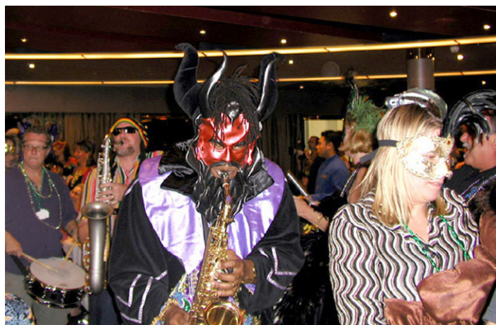
The Mardi Gras Parade in the dining room.

Days 6 & 7 were all at sea and the party strengthened. As I mentioned above, there were no formal nights on the Blues Cruise, Instead they had theme nights. The best of these was on Day 6 - Mardi Gras Night. It started with a parade through the dining room which included the cooks, and later hundreds of cruisers dressed up for the night. Some of the costumes were quite a sight! There was also a Pajama Night as we left Tortola, and a Pillage &