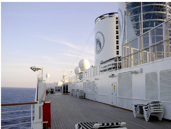
The top deck in early morning.

that walking completely around Deck of the 951-foot-long ship 3 three times was a full mile. I figured throwing the diet out would warrant that after each dinner. The power walk didn't take that long and the 75° weather and the sounds of the Caribbean Sea made it quite nice indeed.