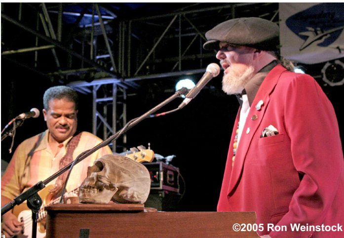
Dr. John stirring the gumbo.

at all. Dr. John mixes jazz and blues into his Creole voodoo swamp gumbo, and Derek Trucks, though he played some blues, was really more of a jazzy jam band. In fact, he even did a version of John Coltrane's take on "Greensleeves" that blew