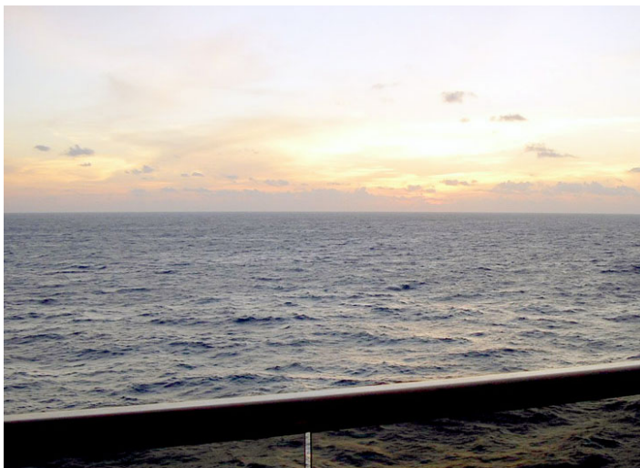
A Caribbean sunrise.