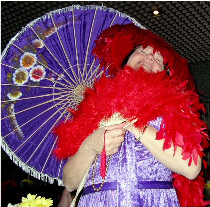
Another colorful reveler on Mardi Gras night.

had to pay at that one. Other than that - the food was free - all included in the price of the cruise. Coffee and tea were also free any time of the day or night. Pop was not, but you could buy a pop card for the week. I ate like a pig all week with total disregard for calories, fat content or what time it might be. What price did I pay? I lost 7 pounds. Figure that one out! All that walking perhaps - both on the ship and on shore - and the dancing as well.