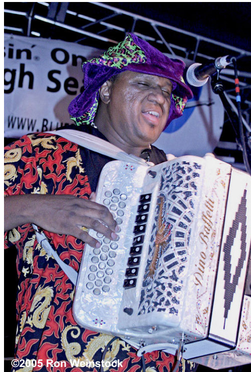
Chubby Carrier leading a zydeco party.

other one I could not get enough of. And although I'd heard Dr. John several times, the cruise sets were the best I'd heard from him. Although he played mostly songs from his latest excellent Blue Note album N'Awlinz (including "St. James Infirmary"), he did several old Dr. J. favorites as well, including "I Walk On Guilted Splinters" and Right Place, Wrong Time."