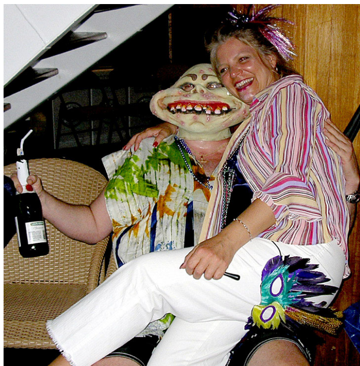
Mardi Gras continues on the pool deck.

Plunder in the Islands Night after reboarding in St. Maarten.