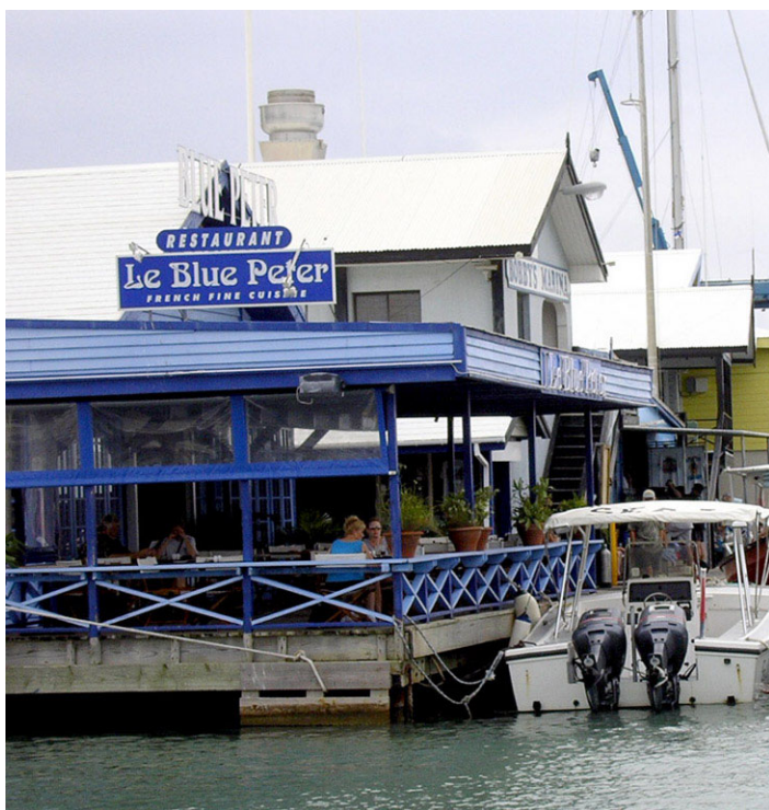
Le Bleu Peter for seafood chowder. ant bowl of seafood chowder. As we left St. Maarten, Susan Tedeschi played on the pool deck.

Days 6 & 7 were all at sea and the party strengthened. As I mentioned above, there were no formal nights on the Blues Cruise, Instead they had theme nights. The best of these was on Day 6 - Mardi Gras Night. It started with a parade through the dining room which included the cooks, and later hundreds of cruisers dressed up for the night. Some of the costumes were quite a sight! There was also a Pajama Night as we left Tortola, and a Pillage &