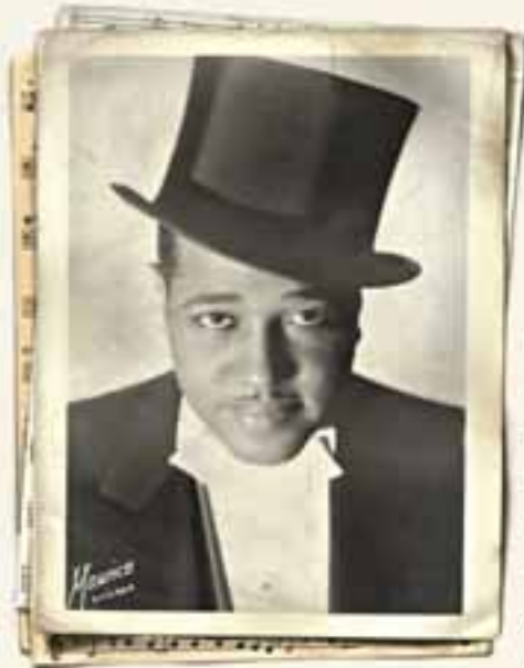
A piano player. A composer. An orchestra leader. Duke Ellington rigned over a land called jazz.

powerfully on the piano, but it was the full orchestra that he considered his most compelling instrument. He introduced improvisation to his compositions — a process unheard of using a 15-piece orchestra. The result was a different approach to jazz that sparked a revolution and an evolution. His music spread across the world with songs like "Sophisticated Lady," "In a