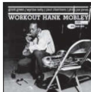
Workout, Hank Mobley