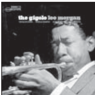
The Gigolo, Lee Morgan