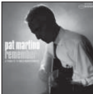
Remember, Pat Martino