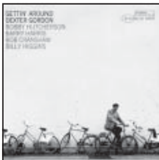
Gettin' Around, Dexter Gordon

From 1953 to 1967, Alfred Lion produced a body of work that ranks as the most innovative series of recordings in modern jazz. Almost all of these masterpieces were documented by the extraordinary Rudy Van Gelder; a self-taught engineer who more than set a new standard. Devoid of caution or timidity, he captured the full power and rich sound of jazz ensembles with dazzling clarity. His contribution to the focused approach that Blue Note took at every stage of any album was immeasurable. Decades later, Rudy agreed to take a second look at the original recordings, bringing them into the digital domain with the same skill and focus. Six more RVG Editions have just been released. If you think you've heard these gems before, listen again.