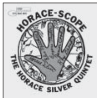
Horace-Scope, Horace Silver Quintet