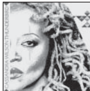
Thunderbird, Cassandra Wilson