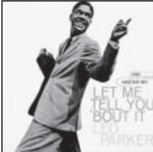
Let Me Tell You 'Bout It, Leo Parker

From 1953 to 1967, Alfred Lion produced a body of work that ranks as the most innovative series of recordings in modern jazz. Almost all of these masterpieces were documented by the extraordinary Rudy Van Gelder; a self-taught engineer who more than set a new standard. Devoid of caution or timidity, he captured the full power and rich sound of jazz ensembles with dazzling clarity. His contribution to the focused approach that Blue Note took at every stage of any album was immeasurable. Decades later, Rudy agreed to take a second look at the original recordings, bringing them into the digital domain with the same skill and focus. Six more RVG Editions have just been released. If you think you've heard these gems before, listen again.