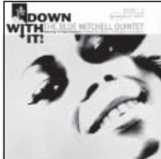
Down With It, Blue Mitchell