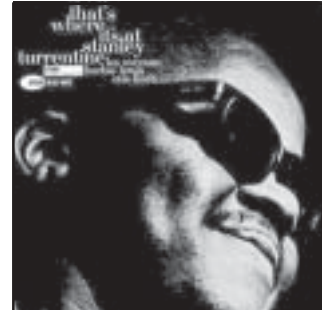
That's Where It's At, Stanley Turrentine