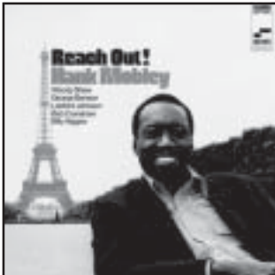
Reach Out, Hank Mobley